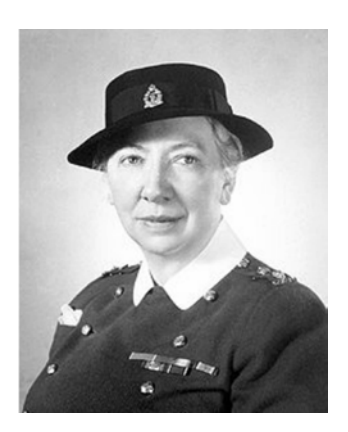
Figure C-4 Colonel Elizabeth Lawrie Smellie