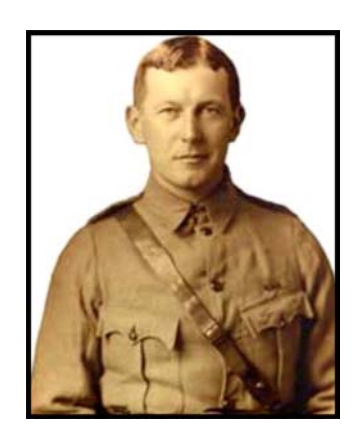
Figure C-5 Lieutenant-Colonel John Alexander McCrae