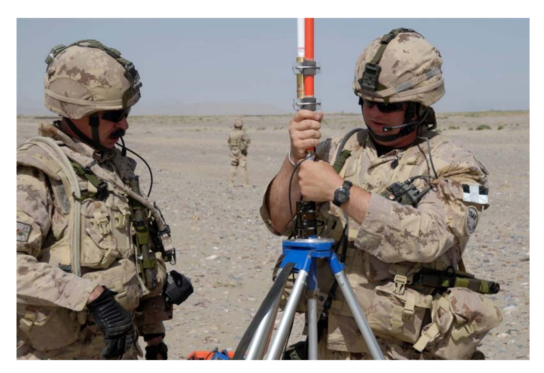
Figure C-2 Engineers