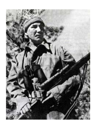
Figure C-8 Sergeant Thomas George Prince