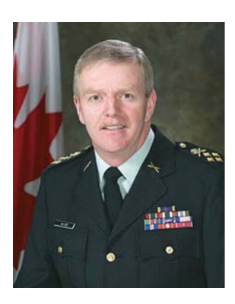
Figure C-10 General Richard J. Hillier