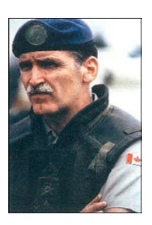
Figure C-9 Lieutenant-General Romeo Antonius Dallaire