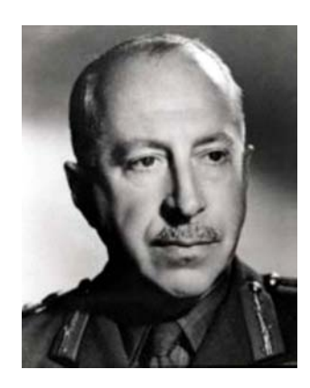
Figure C-7 General Henry Duncan Graham Crerar