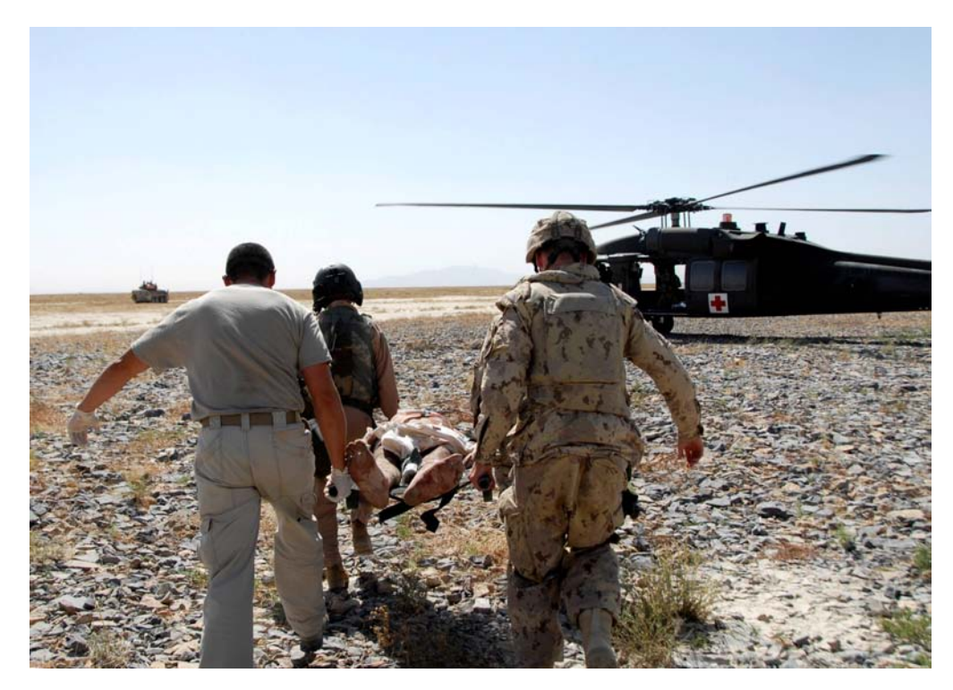
Figure C-1 Transporting Injured Soldier to Medical Services

The motto of the CF Health Services Group is "Militi Succurrimus" (We hasten to aid the soldiers).