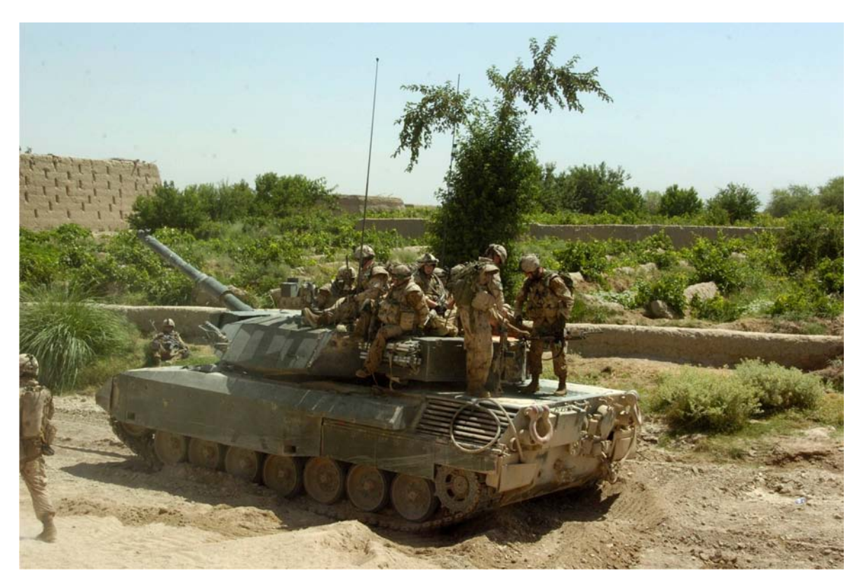
Figure A-1 Armoured Fighting Vehicle (AFV)