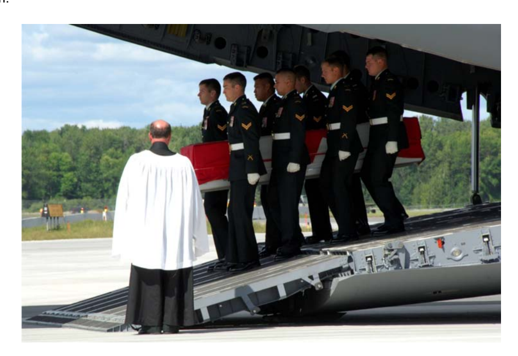
Figure C-3 Chaplain Presiding Over a Ramp Ceremony