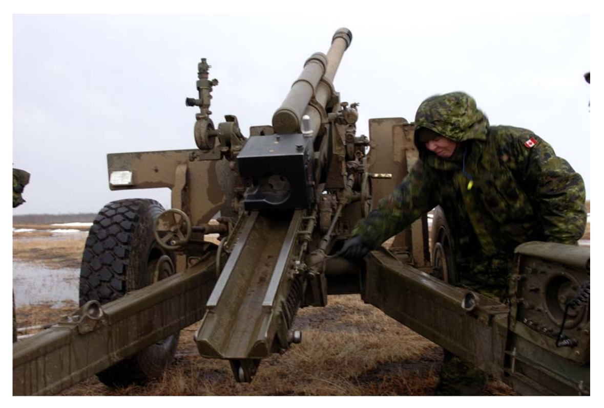
Figure A-2 Field Artillery