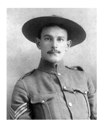
Figure C-2 Sergeant Edward James Gibson Holland