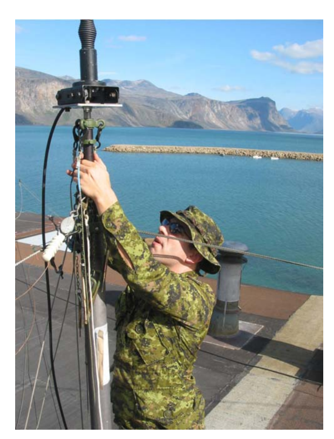
Figure B-1 Signals Operator

Signals Operator. Responsible for providing the army with fast, reliable voice and data communications using top-of-the-line satellite, digitized, fixed, air-transportable, and mobile information and communications equipment.